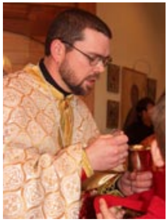
Visitors to your parish website want to see an active sacramental life. Make sure to show photos of regular services, in addition to special events.

photogenic, but often when they see a camera, they tend to stop their natural activity and "smile" for the camera. To avoid the "cheese" look and get natural photos, use a long zoom and stand back in order their natural activity. Show photos of children involved in a variety of ways, both inside the church, and also during social events. Keep in mind when posting photos of children on a website to always have parental consent, and never post names of the children, for safety purposes.