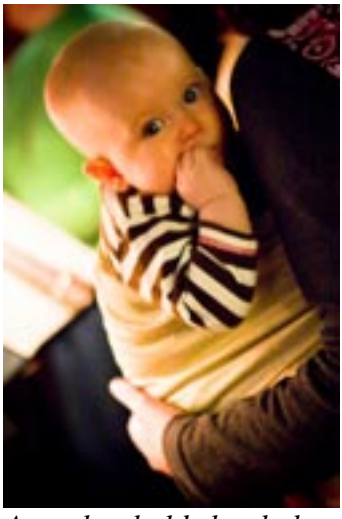
during the Divine Liturgy.