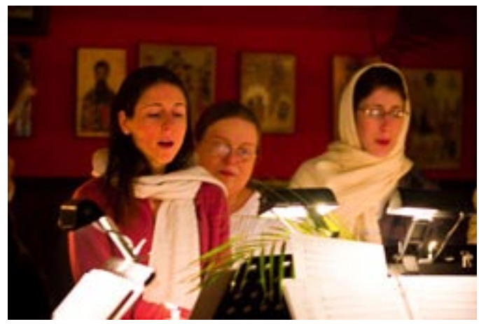
People coming for a visit will want to see ways they can be involved. Show members of the choir singing, or altar boys serving, or other ways in which people of the church can minister.