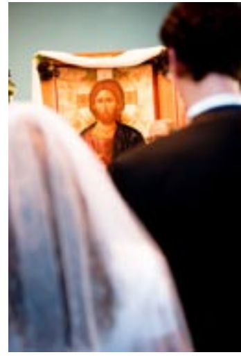
The scene here is very clearly at a wedding, but just as the focus of any marriage should be on Christ, so is this photograph.

When choosing your angle to take a photo, make sure to remember to change your vertical plane. Try to get above the action from a balcony, or get your camera down on the floor and shoot looking up. When shooting children, get down to their level so as not to always photograph them from above. It's ok to block the primary subject with an interesting foreground element to help set the scene (as seen in the center photo).