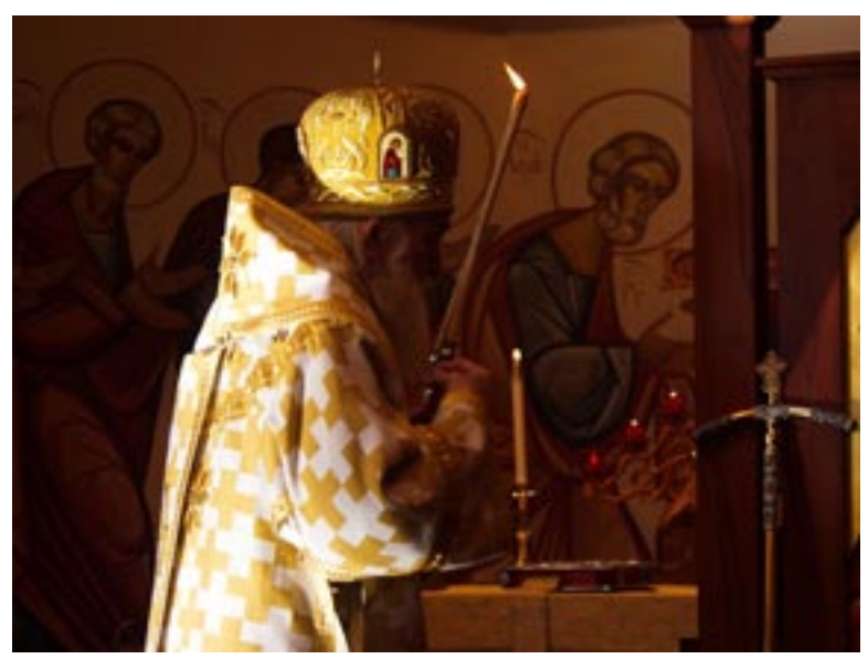
Although the face of His Eminence, Archbishop DMITRMI is not illuminated in this photo, and I could have illuminated it if I used flash, I chose to allow the natural light streaming in from the window to create a beautiful and dramatic lighting on his vestments.

However, generally, the most beautiful light that we have access to is simply the very light that was created by God: natural light. Natural light is soft, directional and abundantly available! In churches, we can often take advantage of natural light from windows and open doors.