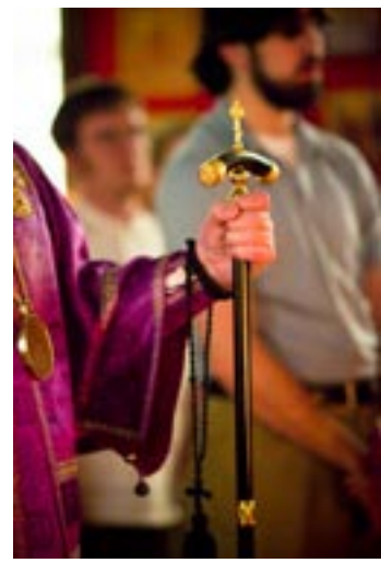
The Bishop's staff becomes the primary subject of this photo. This seemingly strange subject shows off the small details of this Hierarchical visit. The small glimpse of purple vestments helps to set the scene as being a Hierarchical visit during Great Lent.