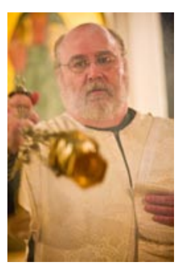
A deacon swinging a censer is also a common event at every service, but this angle shows the action of the primary subject and gives the viewer the feel of being in the scene.