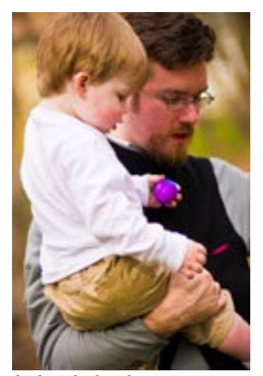
A father helps his young son at A mother holds her baby the parish Easter Egg Hunt.