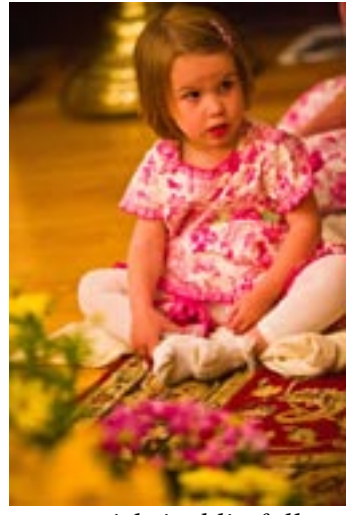
A young girl sits blissfully unaware of the camera pointed in her direction.