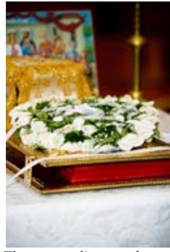
The crowns lie atop the Gospel at the start of a wedding ceremony. In the background you can see the covered common cup and the scene is truly set with the icon of the Wedding of Cana in the background.

the story, they help the story to flow, and they add interest to an otherwise ordinary service. Details count!