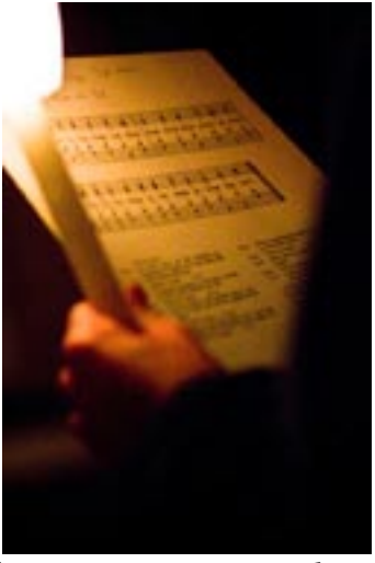
The music sung on Pascha is illuminated with just a single candle. The subject of this photo is not the person singing the music, but rather, the music itself. It is clear from this photograph where and when this service is taking place.